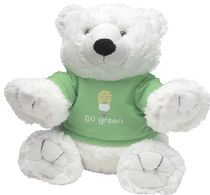
Small Plush with T-Shirt