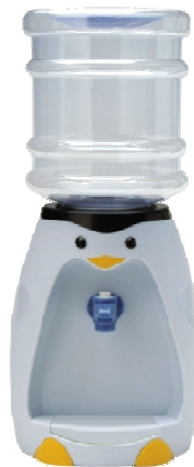
Desktop Water Dispenser