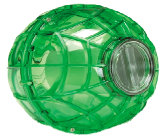
Ice Cream Maker