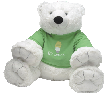
Large Plush with T-Shirt