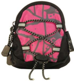
Mini Keychain Backpack